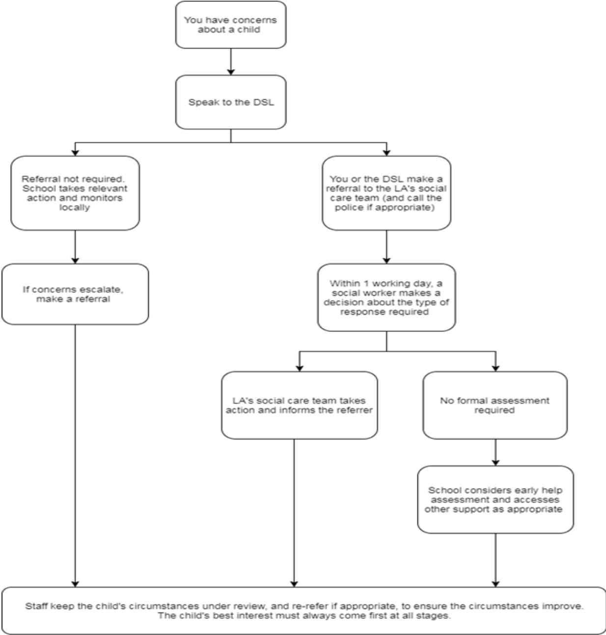
8.9. Figure 1 The DSL should be spoken to, in the first instance, in order to agree a course of action.